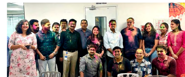
Enovix India celebrating Holi