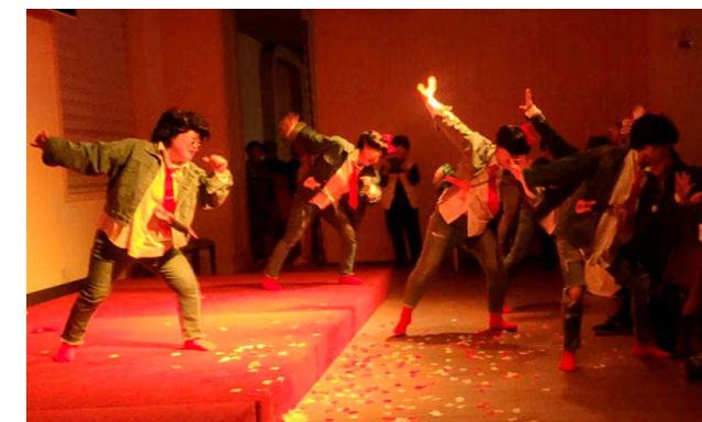
Enovix Korea, talent show performance, pack assembly team