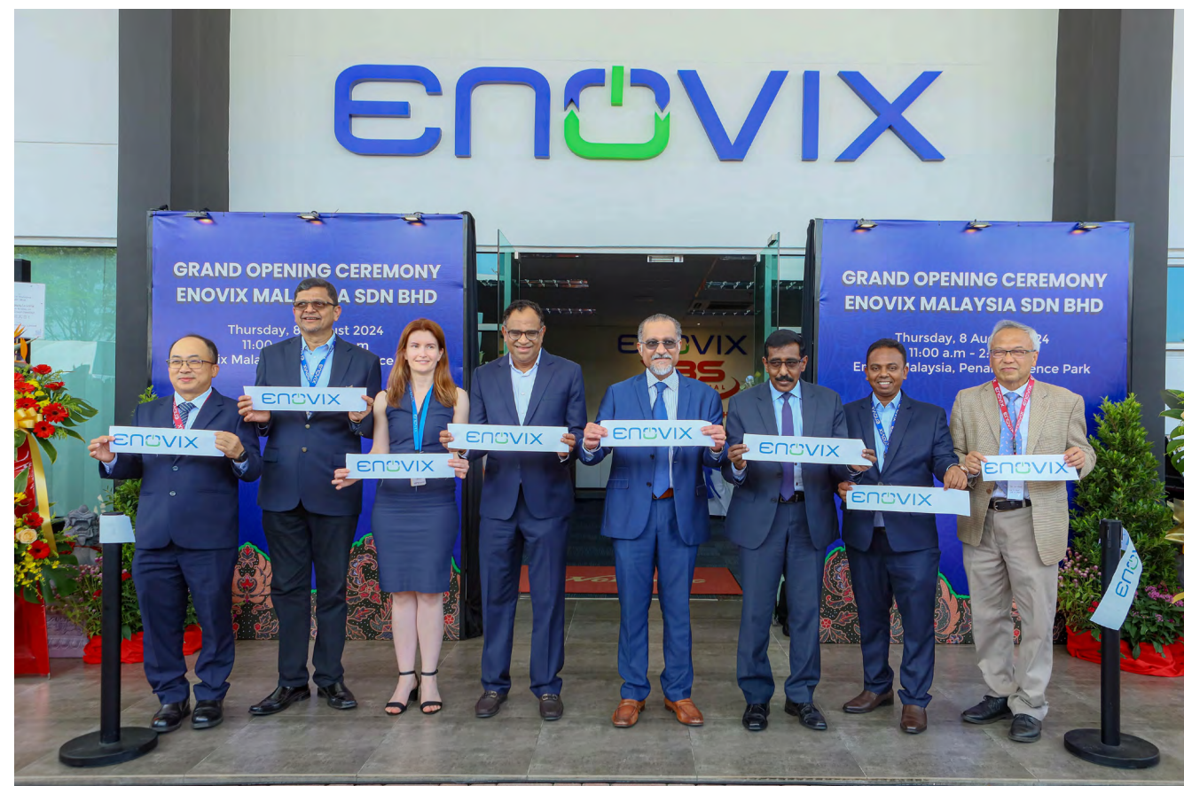
Enovix Malaysia, Fab2 Ribbon Cutting Ceremony

To date, we have concentrated our operational effort on researching, developing and commercializing the cutting-edge technology behind our silicon-anode lithium-ion battery. We have provided engineering