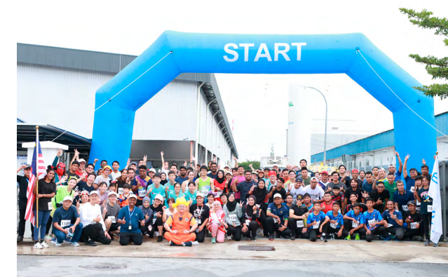
Enovix Malaysia participating in a Fun Run

At Enovix India, team bonding is an integral part of our culture, bringing together an amazing team of talented individuals. The atmosphere here is characterized by talented team members who foster a supportive and collaborative environment. Being part of Enovix means being part of a vibrant community where each individual is empowered to contribute their unique perspectives and talents, cultivating a positive and dynamic work environment. The energy and enthusiasm within our team are palpable, making Enovix not just a place of work, but a place where everyone looks forward to coming together and achieving great things.