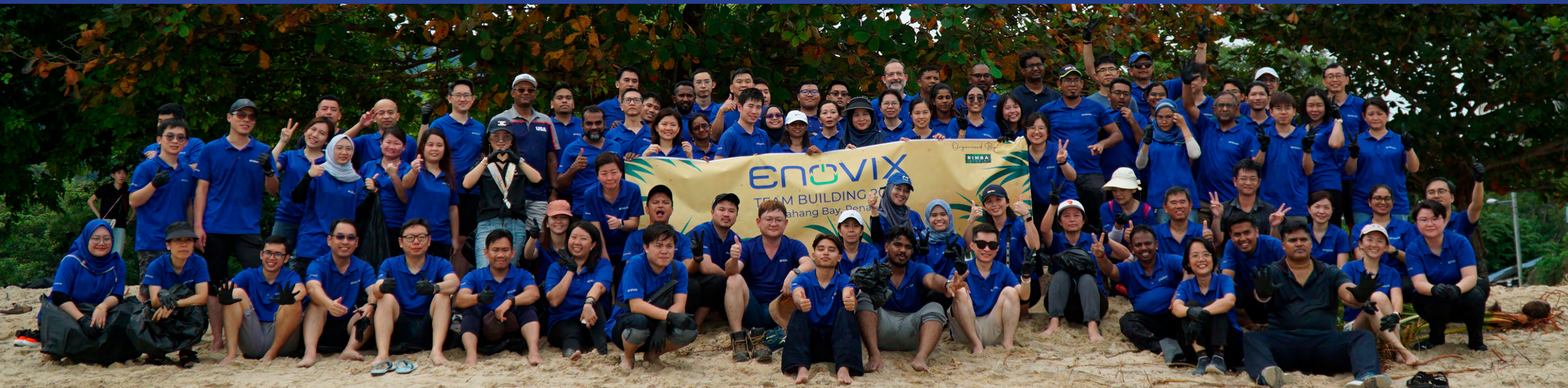
Enovix Malaysia team celebrating their

compensation as defined in these plans. For fiscal year 2024, our employer contributions to these plans were $1.0 million.