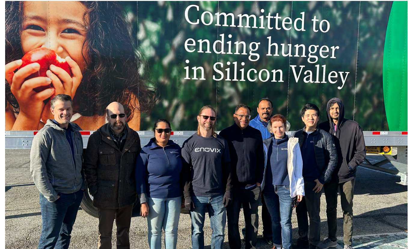
The Fremont office volunteering with the Second Harvest Food Bank of Silicon Valley

Our team in Korea participated in the Korea-Nonsan City Agriculture Project, which supports local businesses and creates a culture of shared growth.